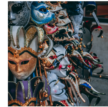
Mardi Gras World