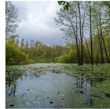
Visit a Swamp