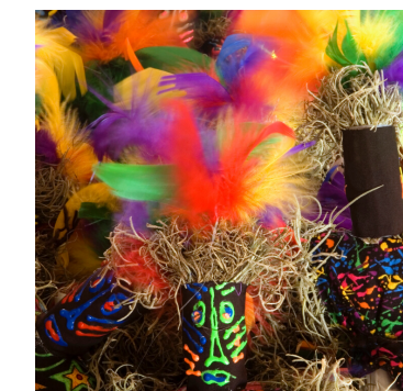
Learn about Voodoo