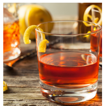
Have a Cocktail