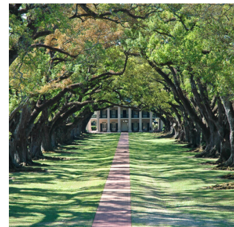
Visit a Plantation